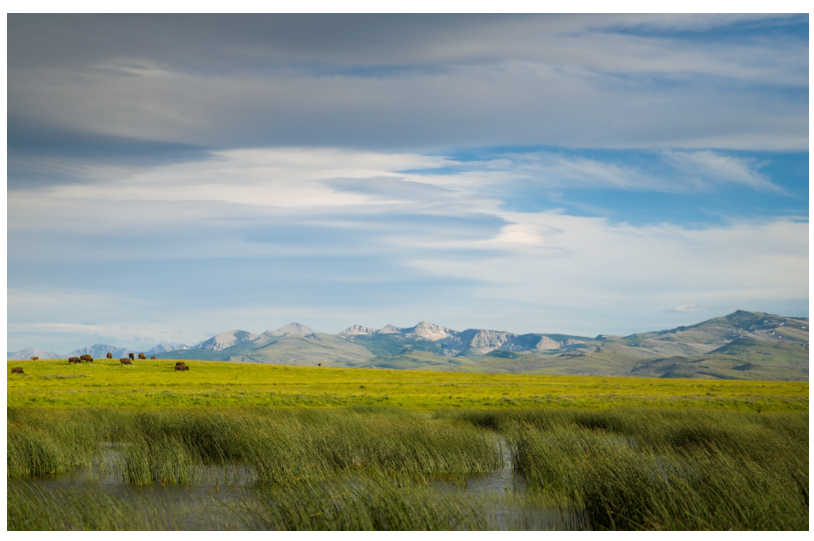
View of the Rocky Mountains on the Blackfeet Nation.

The American Indian Agricultural Resource Management Act of 1993 requires a tribe—or the Bureau of Indian Affairs in close coordination with a tribe—to develop an ARMP that includes specific goals and objectives for management of tribal agriculture and range resources. The Blackfeet Natural Resource Conservation District (BNRCD) developed the Amskapi Piikani ARMP in