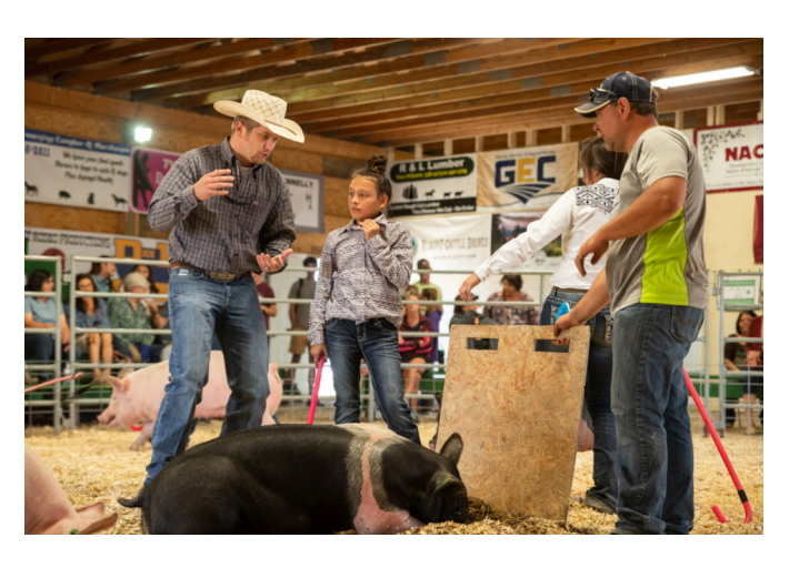
A judge converses with youth at the Charging Home Stampede Agriculture Fair in 2018.

Saokio Heritage has done research and developed two reports. The first report is entitled Ahwahsiin (The Land / Where We Get Our Food) a report that includes traditional ecological knowledge, traditional foods, and modern food