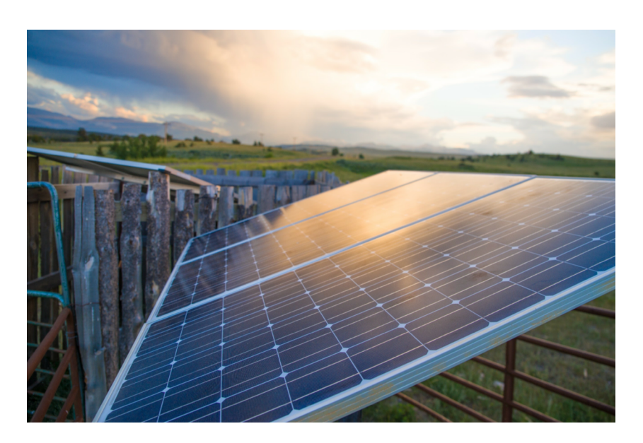
A ranch on the Blackfeet Reservation uses solar panels to support energy needs.

highly processed food consumption have led to increased incidence of preventable health conditions across the Blackfeet Nation. In 2016, the Food Access and Sustainability Team (FAST Blackfeet), a nonprofit within the community, conducted a community food security assessment (CFSA), which also assessed food sovereignty. It revealed pervasive food insecurity with related negative health outcomes. Amid a